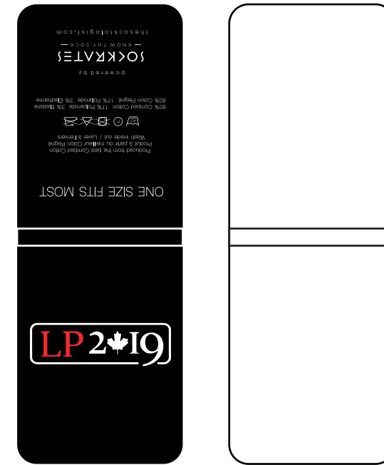
Outside Label (FRONT)